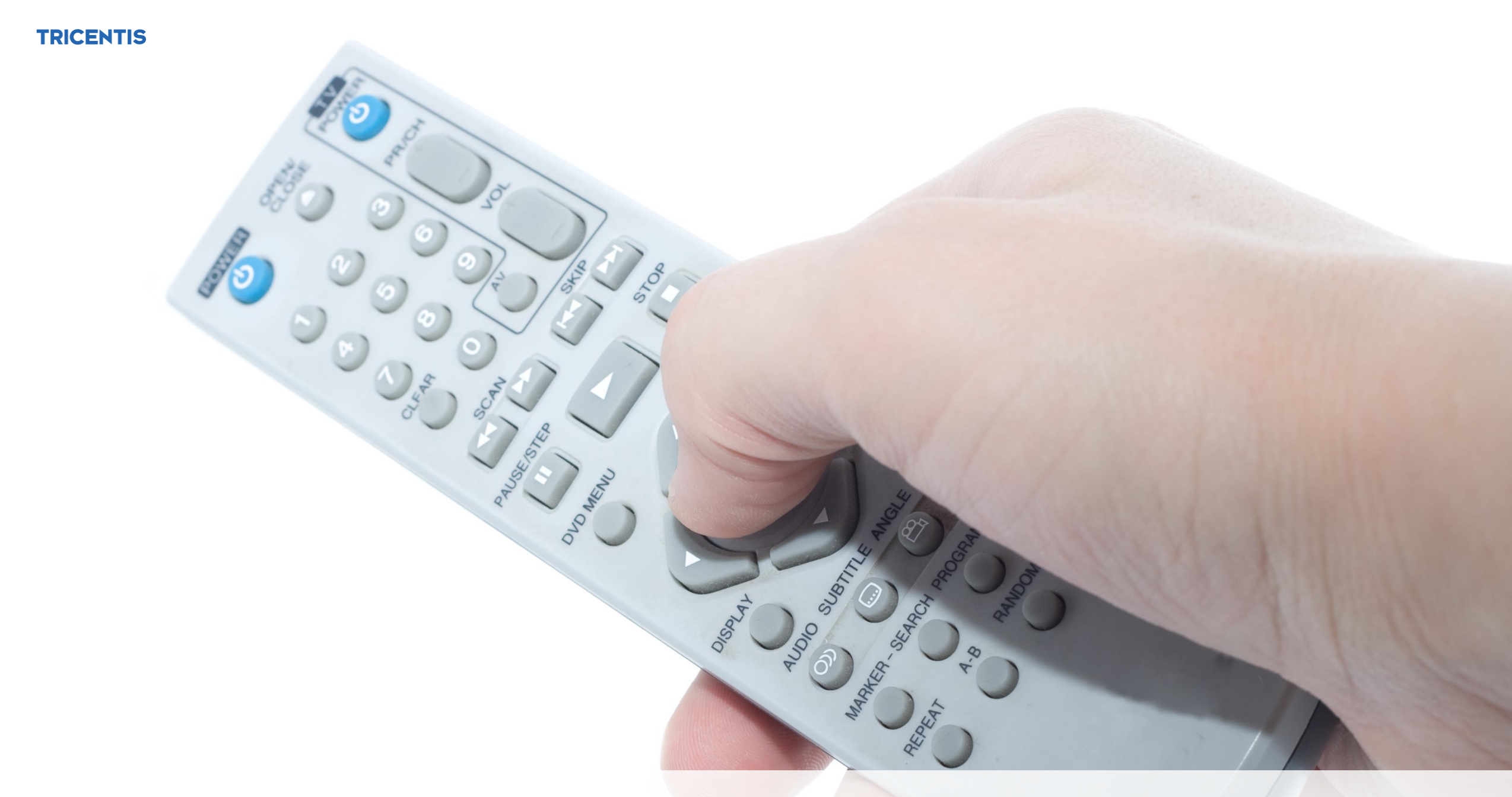
Why do we press harder on the remote when the batteries are dead?